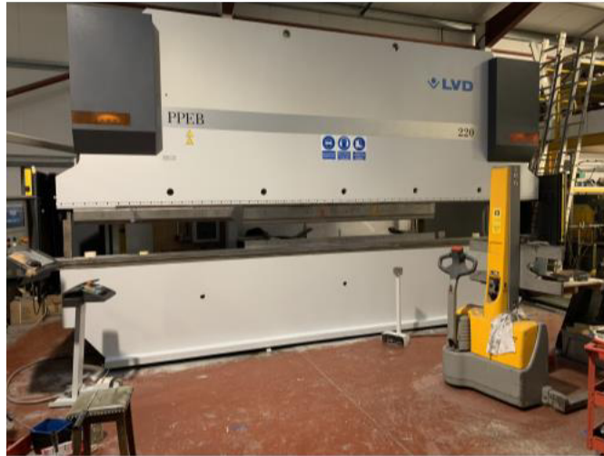
Photograph taken on site before machine has received any attention

LVD PPEB 220/6100 220 Ton x 6100mm 8 Axis Downstroke CNC Press Brake. Manufactured 2001. Cadman CNC Control. With Crowning